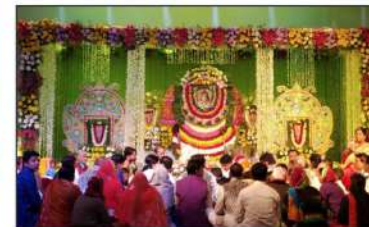
Shyam Bhajan Sandhya