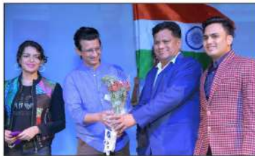
Amrita Rao & Sharman Joshi