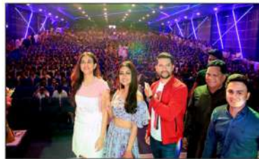
Setters Star Cast